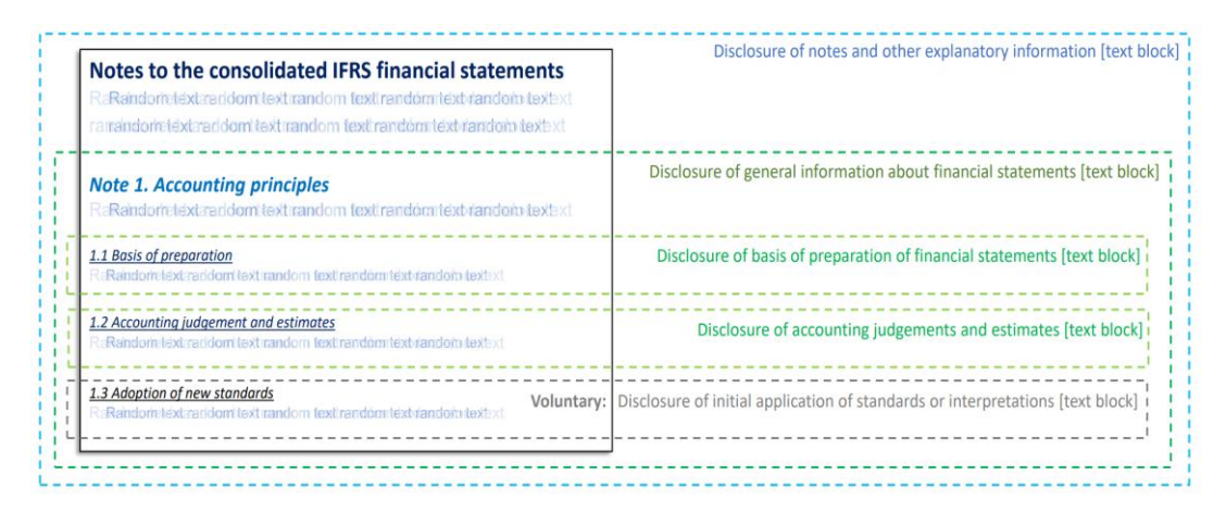
FIGURE 4: EXAMPLE OF MULTI TAGGING THE NOTES TO THE CONSOLIDATED IFRS FINANCIAL STATEMENTS WHEN INCLUDING VOLUNTARY ELEMENTS

In instances where multiple pieces of text corresponding to one block tag are disclosed in different sections of the notes, issuers should tag such disclosures with one block tag by using the Inline XBRL constructs which allow the concatenation (or exclusion) of text content within a document (see Guidance 2.5.5).