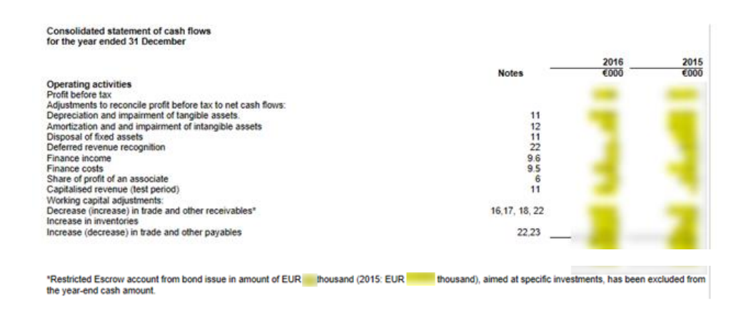
FIGURE 1: EXAMPLE OF NUMBERS TAGGED IN A CONSOLIDATED STATEMENT OF CASH FLOW, INCLUDING NUMBERS DISCLOSED IN FOOTNOTES

In addition, issuers may apply on a voluntary basis XBRL footnotes to mark up the entire text of a footnote related to any portion of their financial statements or of the annual financial report (see rules defined in Guidance 2.3.1.).